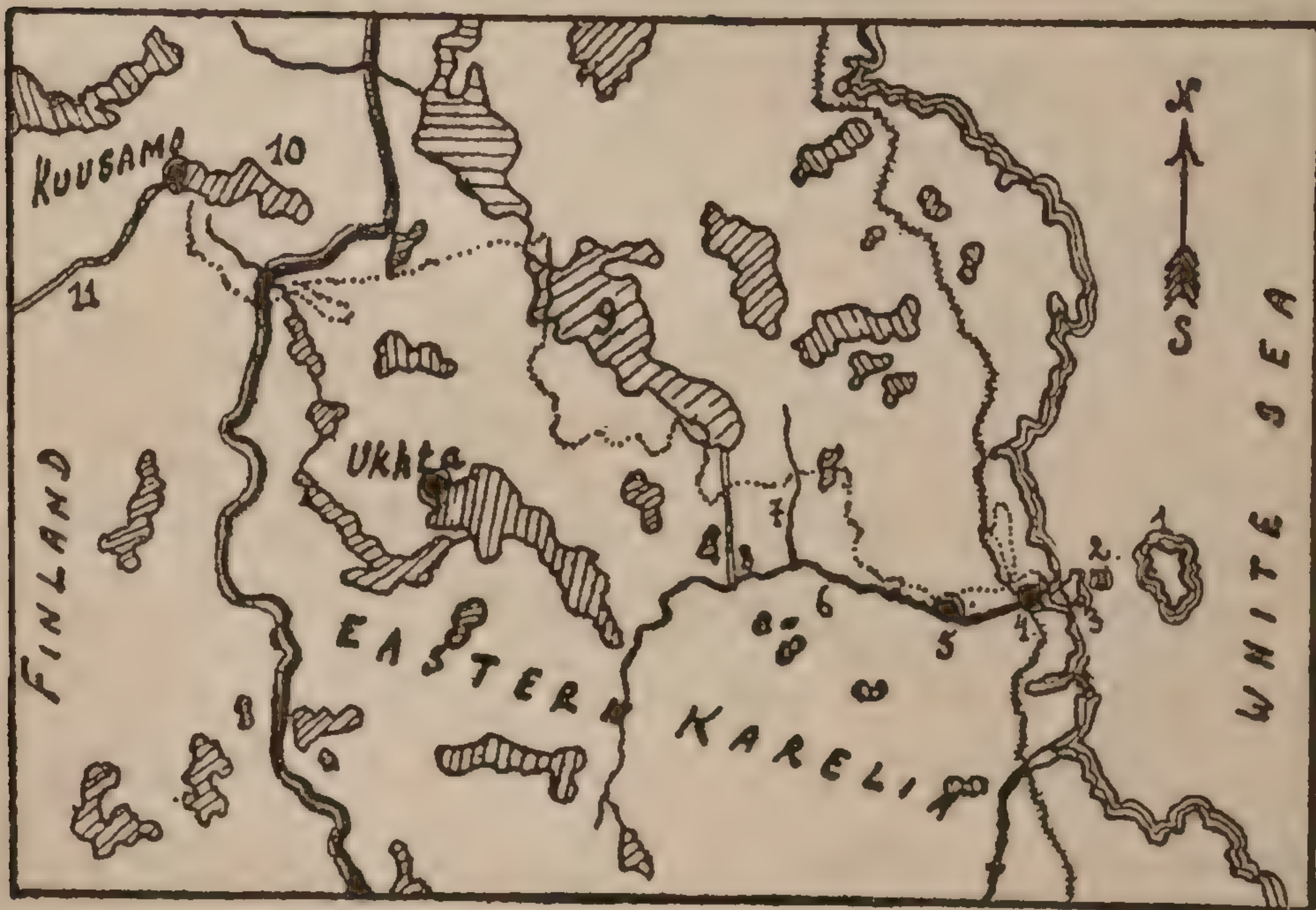
ROUGH MAP SHOWING OUR ROUTE (marked with dots).

Our bread was all finished. We had thirty bits of sugar left. We had introduced a "starvation ration," and were sharing out every crumb, when we came to the hamlet Poddiujnoe.