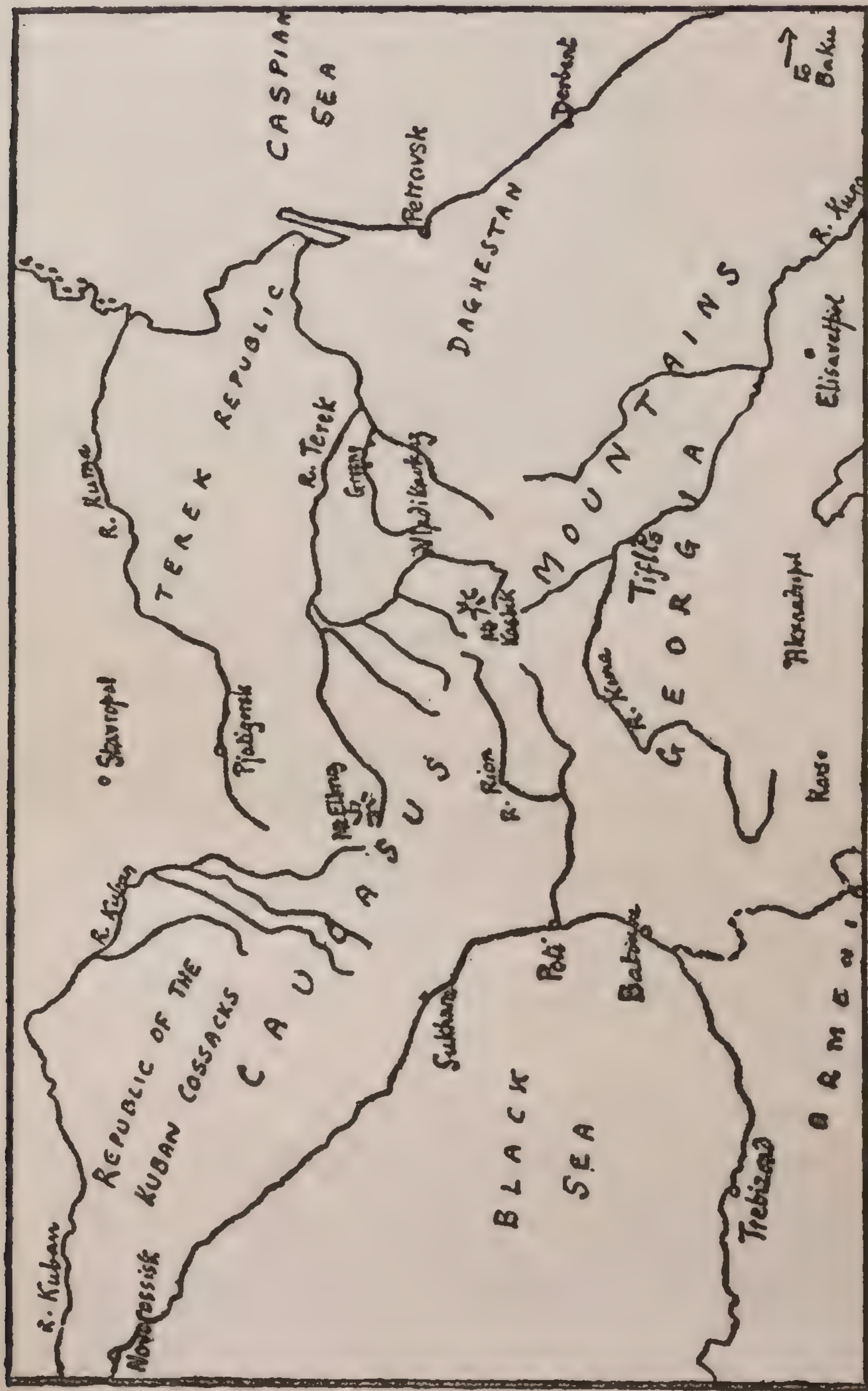
MAP OF THE CAUCASUS, TO ILLUSTRATE PART I.