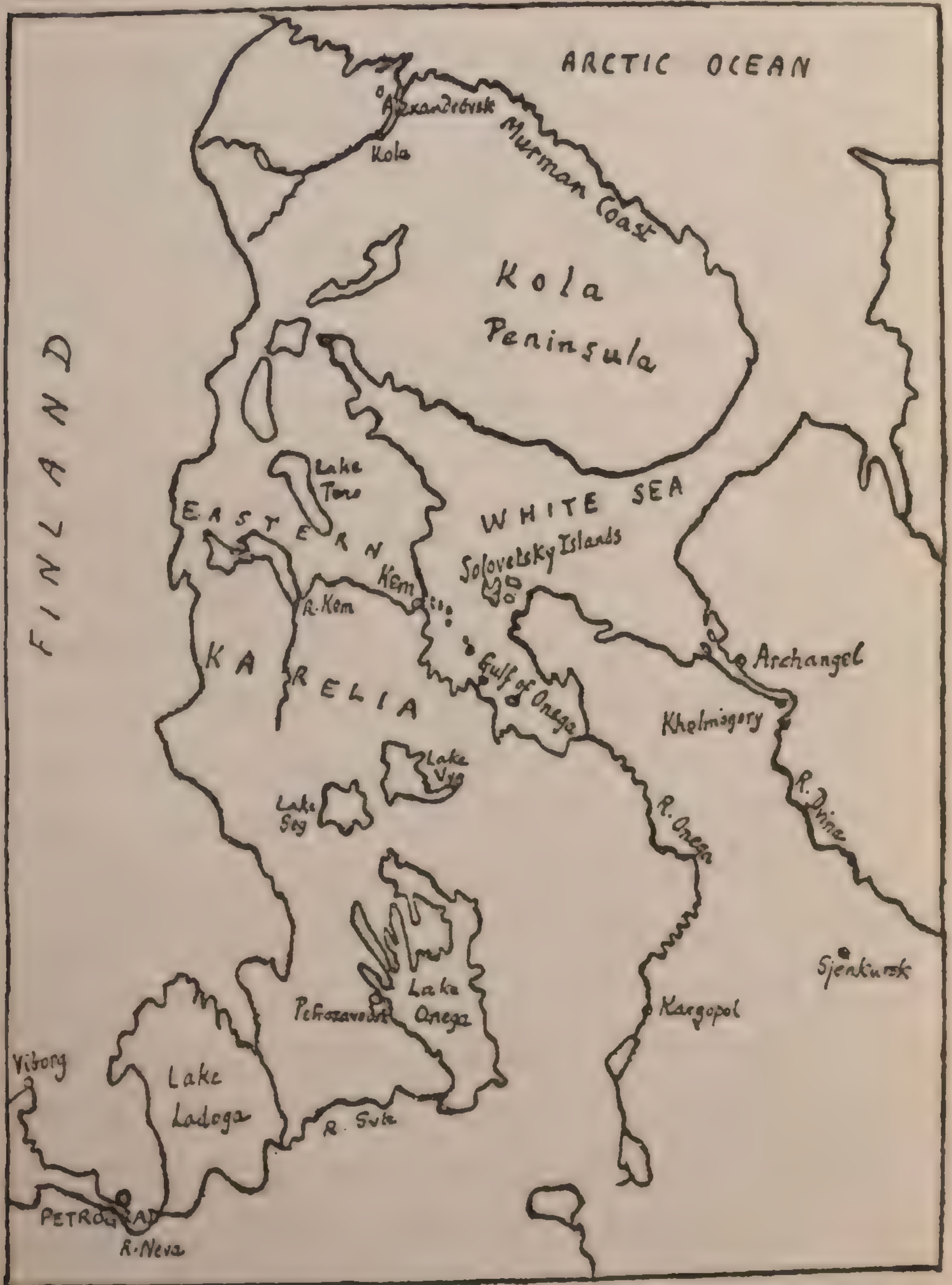
MAP OF NORTH-WESTERN RUSSIA, SHOWING THE SOLOVETSKY ISLANDS.